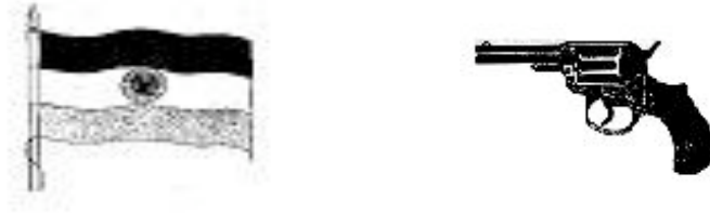
FIGURE 1 Example of picture shown on screen in experiment 1.

The antecedent was systematically controlled to be the grammatical subject or object in order to balance the design; i.e., we wanted to avoid the asymmetry whereby only subject antecedents or only object antecedents would be used, since such an asymmetry could lead to participants developing a strategy for processing the sentences. There was no theoretical question associated with this manipulation.